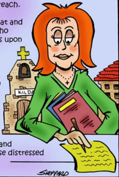
St. Brigid of Ireland

Her extraordinary spirituality, charity and compassion for those distressed were legendary.