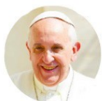
Pope Francis @Pontifex